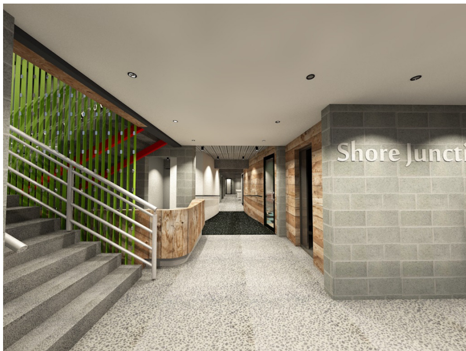
Creative art piece with dog tags, shown in green at the staircase.

You can view this video at www.shorejunction.nz